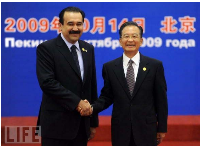
Kazakhstan Prime Minister Karim Massimov (L) shakes hands with Chinese Premier Wen Jiabao during a welcoming ceremony for the SCO Summit.

Kazakhstan's Prime Minister Karim Massimov participated in the 8 th meeting of the heads of government of the Shanghai Cooperation Organization (SCO) in Beijing October 14 and 15, where officials focused on common actions to combat economic woes their countries face because of the crisis.