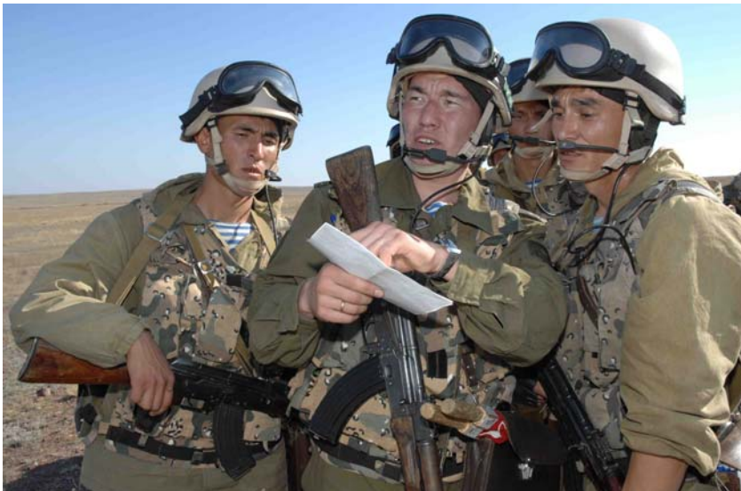
Kazakh soldiers at the exercises.

After two days of intense battles, armed forces of the Collective Security Treaty Organization (CSTO) defeated an imaginary adversary in Kazakhstan on October 16 during the final stage of a joint strategic command and staff exercise "Cooperation 2009" of the newly created collective rapid reaction force (RRF).